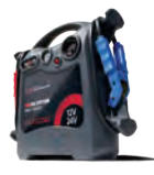
PPS 12/24V 2400/1200 CA