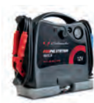
PPS 12V 800 CA